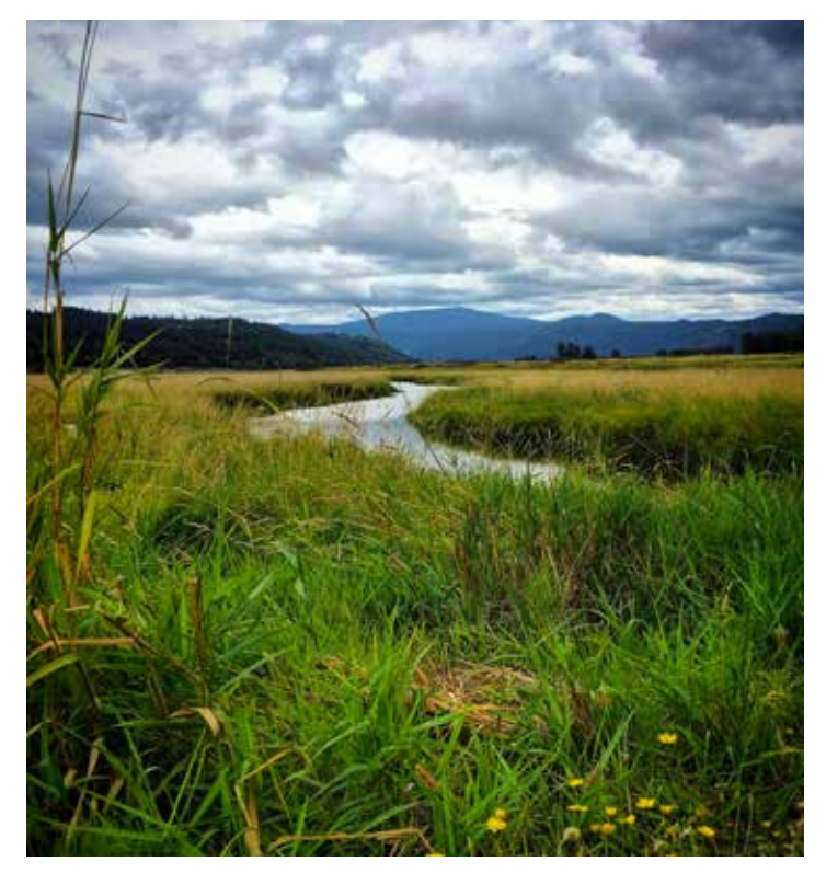
Clouds over Steigerwald.