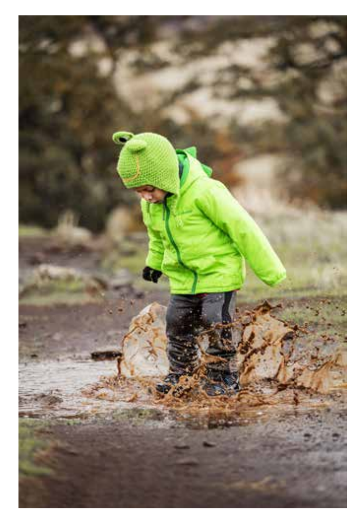
Happy, muddy hiker at Rowena Plateau.